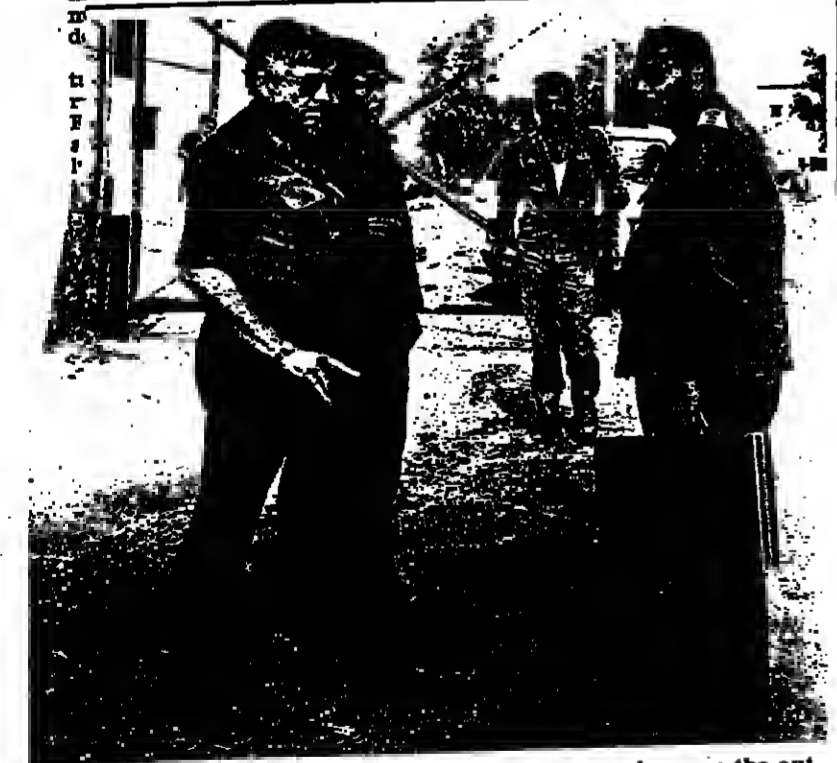
Israel and Egyptian officers talk at a small army base on the outskirts of El-Arish which is ready for handover to Egypt.

Jerusalem Post Reporter EL-ARISH. — It was the last weekend before the withdrawal, but the expected border of last-minute Israeli tourists to this North Sinai town did not materialize.